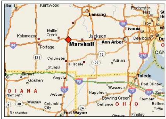
Marshall is in South-central Michigan, at the intersection of I- 69 and I-94.

If you do not live in the Marshall Area we can set you up with a host family to stay with. Just check the box on your form that you desire a homestay and we'll take care of the rest! Last year virtually all of our attendees stayed in Zion congregation member homes. Your host family will provide breakfast on Saturday and Sunday and transportation to and from the church at times shown on the retreat schedule. If you prefer to stay in a hotel you would be responsible for making your own reservation - see the options below. The conference center (Schuler's) is right across the street from the church. The theater, museums, downtown shops, and riverwalk are all within easy walking distance.